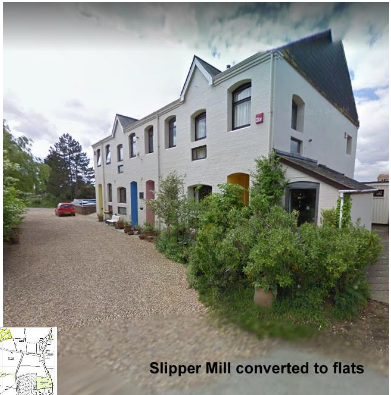
Slipper Mill converted to flats