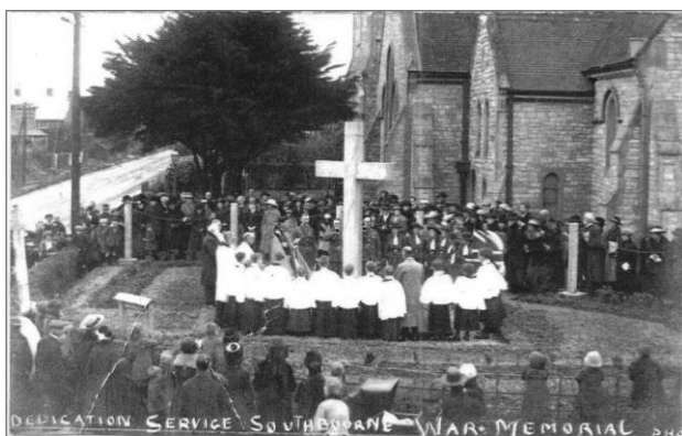
Service of dedication and the unveiling of the Memorial Tablet and Cross held on Thursday 6 th January 1921

Both War Memorials are on St John the Evangelist property. The cross is located on the Green on the corner of Main Road and Stein Road.